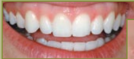
gum sculpting & veneers